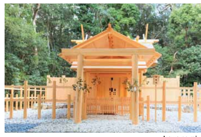
Izawa no miya