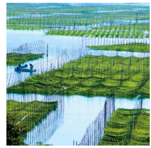
Aosa seaweed-culturing rafts

If you want experience the natural environment of Shima, please visit Shima Nature School and Yokoyama Visitor Center.